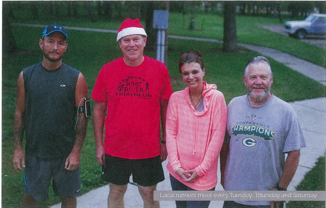
Local runners meet every Tuesday, Thursday and Saturday